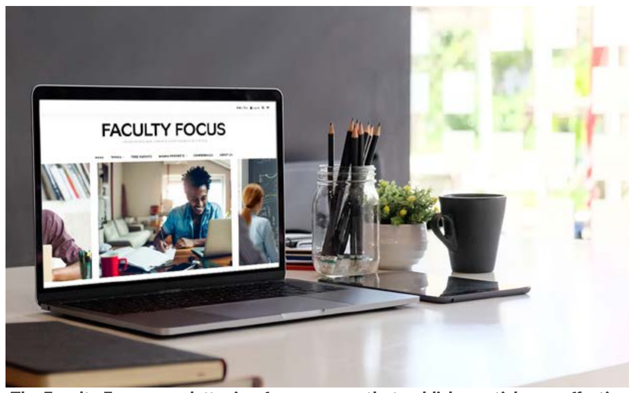
The Faculty Focus newsletter is a free resource that publishes articles on effective teaching strategies for both the college classroom and online course.